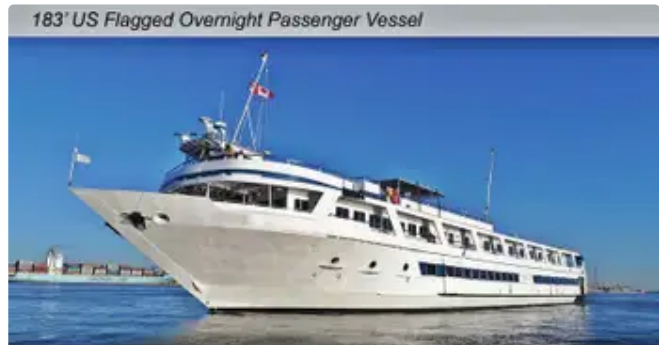
183' US Flagged Overnight Passenger Vessel